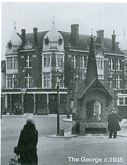
The George c.1935